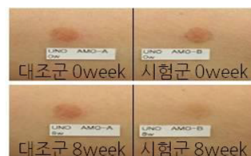
Final verification of whitening efficacy through a clinical test

※ Restoration of rare varieties of native white mother chrysanthemum Refer to pdf (Conservation of Biodiversity – restoration of rare varieties of native species)